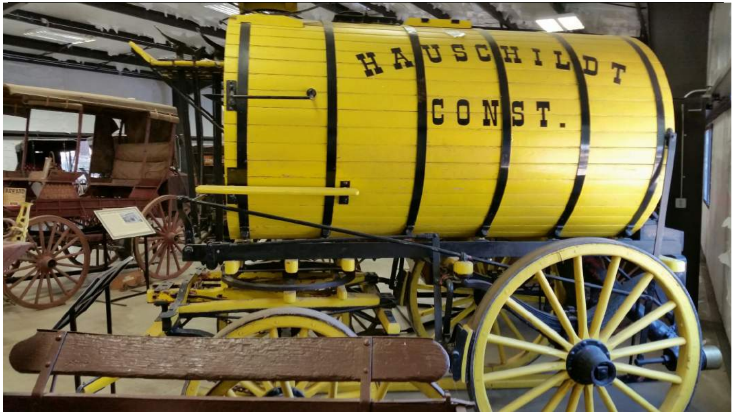
Studebaker Water Wagon at Angels Camp Museum