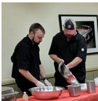
Taste of Tuscany crew prepares our feast