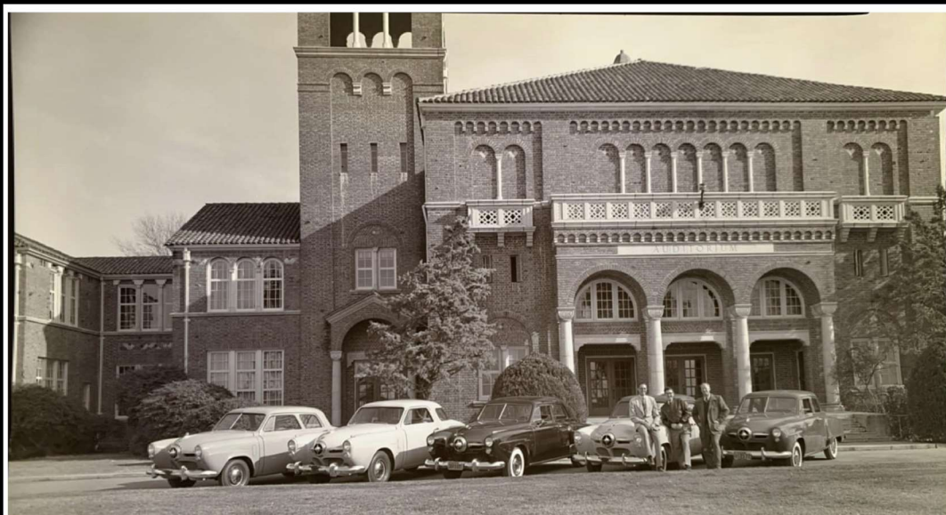
Studebaker Dealership Photo, Marysville High School 1951