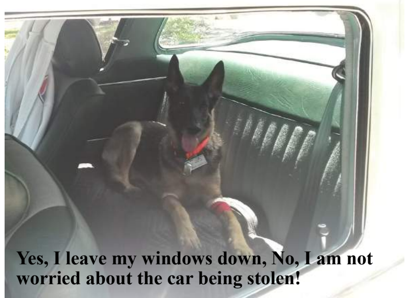
Yes, I leave my windows down, No, I am not worried about the car being stolen!