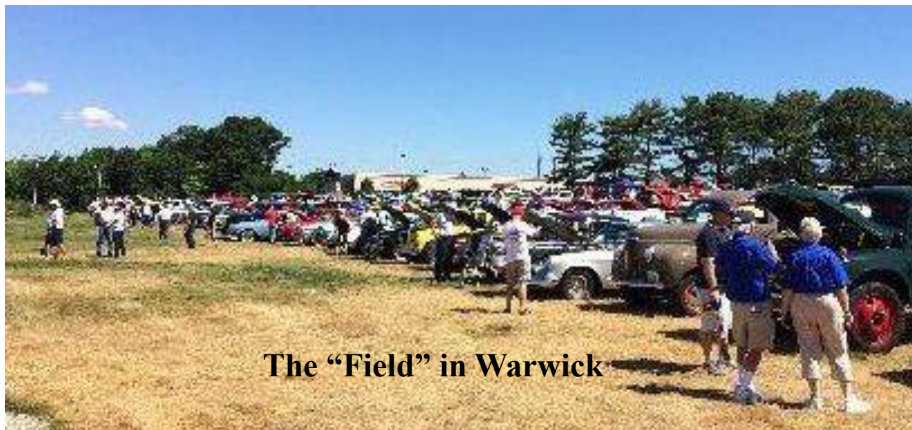
The “Field” in Warwick

If you would like to see lots more pictures of the International Meet in Warwick you can find them on-line here http://www.hotrodhotline.com/52nd-annual-studebaker-drivers-club-international-meet#.V6UfArgrLIV or here: http://www.studebakersla.com/