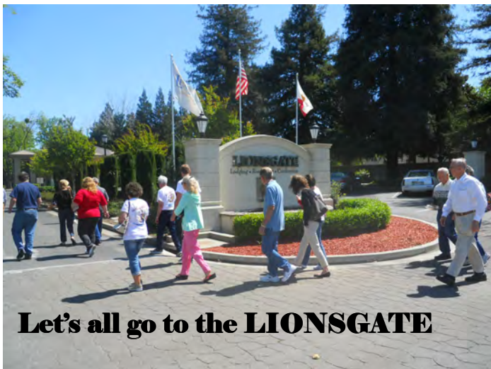
Let's all go to the LIONSGATE

Ads are free and run for two consecutive issues (space permitting) and, if you renew your ad, two additional issues. To start, stop, change, or renew an ad, please contact the Hawk Talk editor.