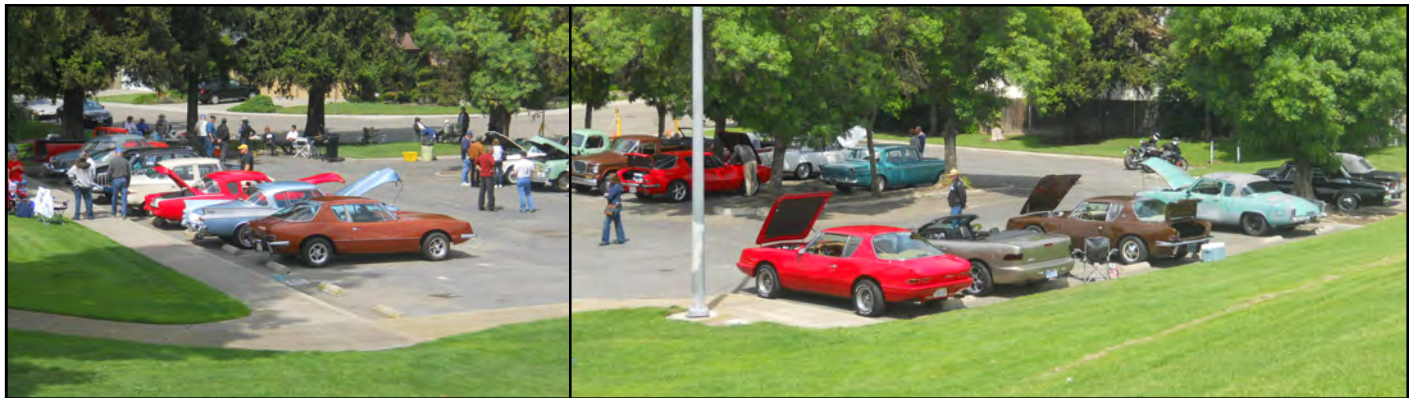
I split one Studebaker in half to get this panoramic view. But that's OK because the one I split was my own.

I counted 22 Studebakers (that includes the 2006 Avanti because it counts as a Studebaker in my book). Lots of food, lots of chat and if you are special (or lucky), a jar of Anne's Pomegranate jelly. I'll skip the words to make room for more pictures.