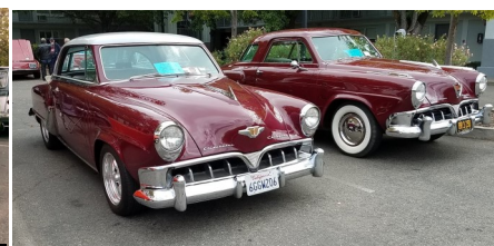
Post WWII Runner Ups