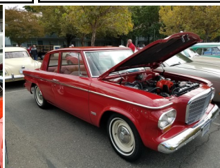
Favorite Lark Type (right)