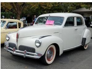
Favorite Pre WWII