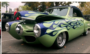
Favorite Post WWII