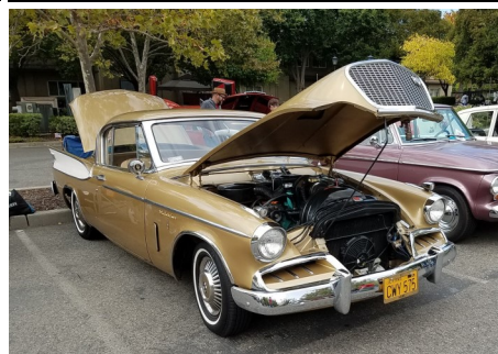
Favorite Driver (also long distance award)