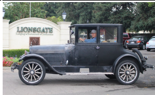
Favorite Survivor (Easy Choice)

Here are the 2019 Pacific Southwest Zone Meet award winning favorites A special thanks to all the volunteer judges—you were all very helpful