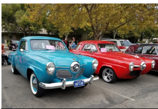
Favorite Woman Owned (1st & 2nd)