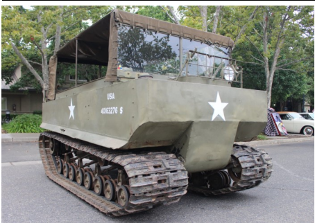
Favorite Special Interest (Oh Yeah)