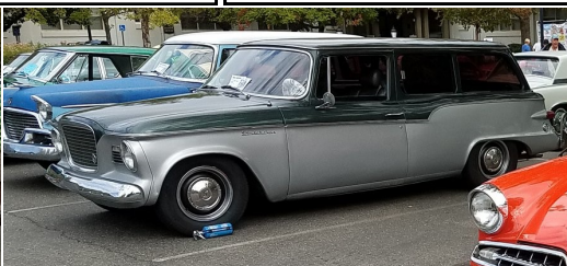
Favorite Sedan or Wagon (center)