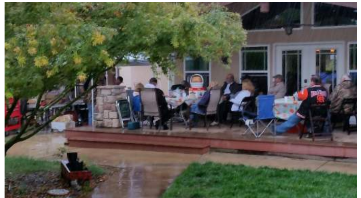
Hearty bidders huddled under the patio