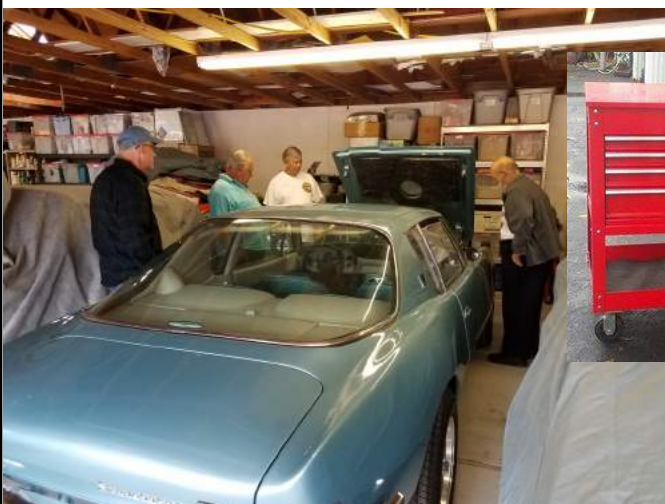
Two of the nicer auction items. Bidding was strong!