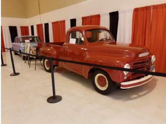
It is amazing how many people are surprised to see a Studebaker Truck!