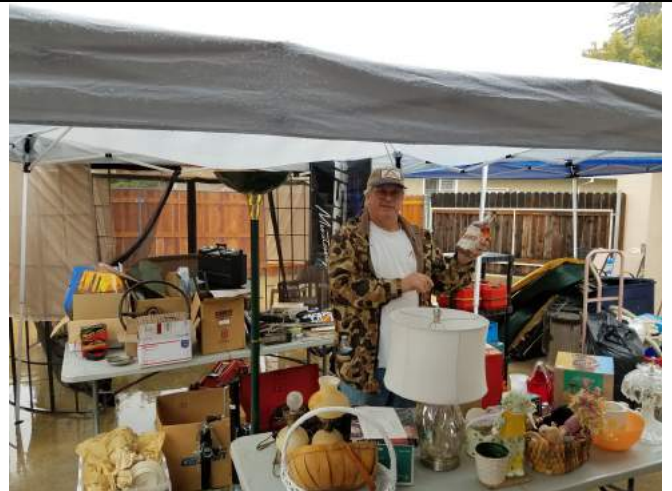
Our esteemed President and Auctioneer extraordinaire shows off some of the prizes.