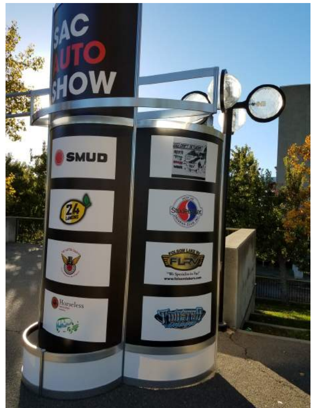
SDC on the Marquee at the International Auto Show

Note from the Editor: Definition from Funk & Wagnalls Standard Desk Dictionary "Editor - To collect, compile and arrange material for publication" This means I don't write everything. I need information to share with other members. Material in any form is welcome. I'll put it together for the newsletter. Thanks, Editor