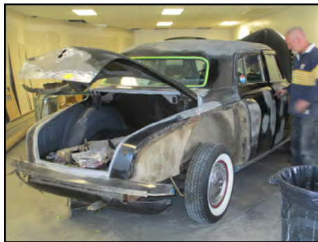
I know my fender bender was in the front, but while it's in the body shop

But, of course, to do complete paint, there are the sundries, like door gaskets, a trunk gasket, front fender vent door gaskets, rear fender welting, hood bumpers and front vent window rubbers! And I realized that now is my chance to get rid of those scratched and dinged up stainless steel fender skirts and get some painted black like I have always wanted... And while I have the headlight buckets out, I want some new six volt halogen bulbs... And I might as well finally upgrade my wheels to those Ford Ranger wheels that I have out back... after I paint them burgundy...Etc.... You know how it goes!