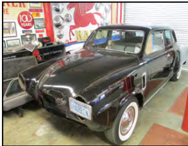
At my shop, just before driving to the body shop.

For over a decade I have used the car in promoting my home and place of work, Harbin Hot Springs and I was wondering how and when I would finally take off all those vinyl decals that have so effectively disguised how badly the car needed a paint job for so long. I located both a presentable upper grille bar in re-chrome-able condition (only slightly more common than hen's teeth) at Desert Valley Auto Parts in Phoenix, Arizona. I purchased an already re-chromed "auxiliary front bumper guard set", Studebaker part number AC - 2202, from Studebaker parts.com, to replace the bent one.