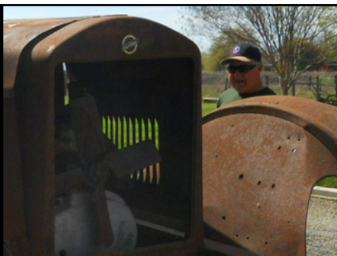
I didn't have enough for the Hot Rods— Maybe I can afford this one.