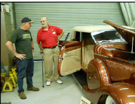
This one is definitely out of my price range George.