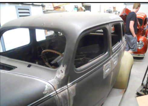
You couldn't tell from the outside what kind of cool things were inside. Everything from finished Rods to projects in various stages of completion. Also, the walls were filled with incredible automobilia and parts just waiting to be mated to just the right car.