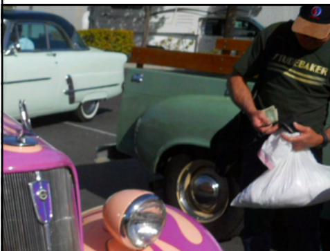
Cool, this Hot Rod is for sale—How much cash have I got on me?