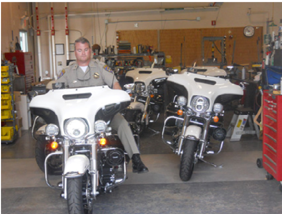
"Harley-Davidson to the rescue" Harleys are now the proud motorcycles of choice for the CHP

The CHP Academy is unique in that it requires all cadets to live at the academy throughout the 27 week training course. Currently, the attrition rate (% of cadets who don't make it through to graduation) is ~35%, and over 50% in the motorcycle training group. This is a "military style" training facility.