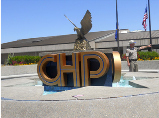
"The CHP Fountain" Each of the 225 deceased CHP officers is honored with a bronze plaque on the outer edge of the fountain.

One of the events offered at this year's Zone Meet was a tour of the California Highway Patrol Academy. Fourteen of our bravest passed through the security gate of the CHP Academy at 10am for a 4-hour adventure amongst the 457 acre site in West Sacramento.