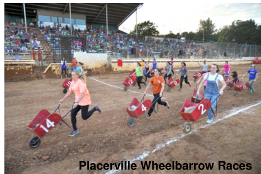
Placerville Wheelbarrow Races

September 12 th brings International Drive Your Studebaker Day. This year the Pacific Southwest Zone Meet is in Henderson Nevada October 9-11. It's Vegas baby!