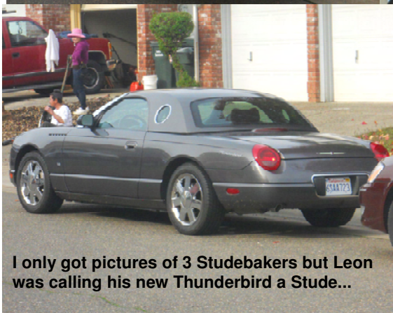
I only got pictures of 3 Studebakers but Leon was calling his new Thunderbird a Stude...