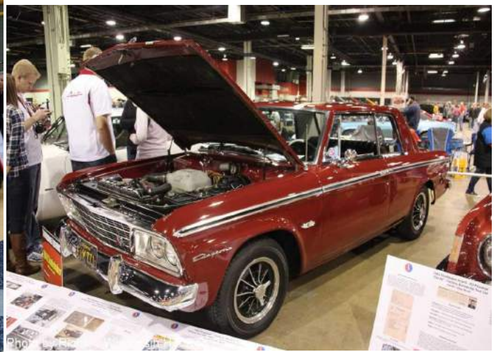
Barn Find 1964 R2 Daytona