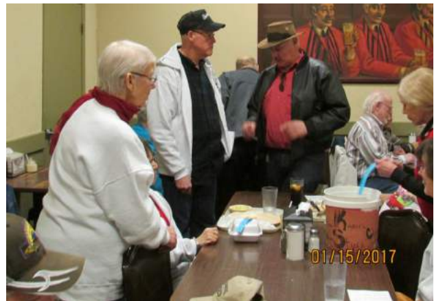
Tres amigos discussing a cervesa run across the border or possibly the next highly secret and confidential Studebaker conquest...