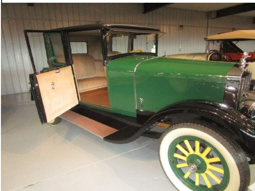
1926 Franklin Doctor's Coupe with the lion hood ornament