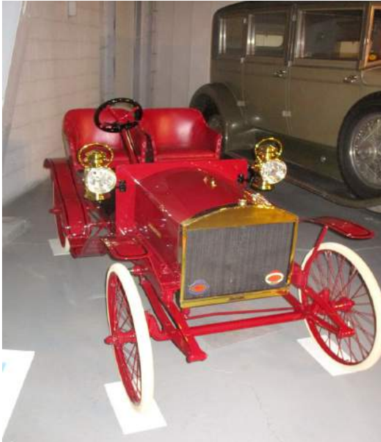
1908 Brownie car. A child's "training car"