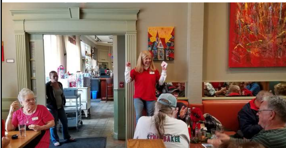
Now listen up everybody, we're gonna have so much fun! Here are the rules! #1 You can't steal from me!