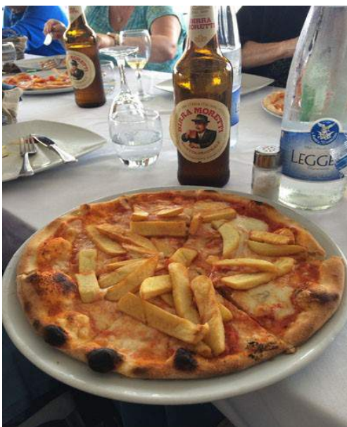
Yes, pizza with French fries. Suggest ham and pineapple and they think you are crazy.