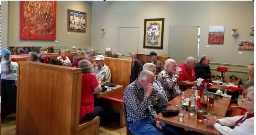
Can you imagine the conversations going on?