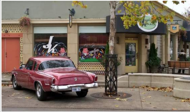
Leonard Peggy got a primo parking space right down in front!