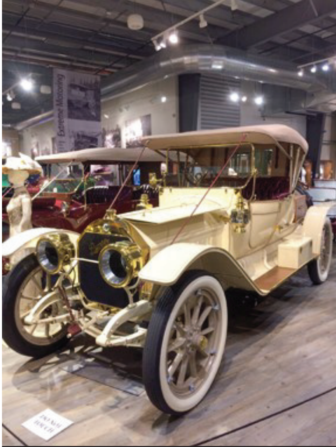
1912 Premier, built in Indianapolis, Indiana. It has a 501 Cu in engine, generating 50 HP. It has a unique air start system that consists of a compressor and an air cylinder. Before stopping the car the driver turns on the air pump and stored 150 psi in the cylinder. To restart, the driver opens the cylinder valve and air is distributed to each cylinder in the proper firing order to each piston and the car starts with virtually no noise.