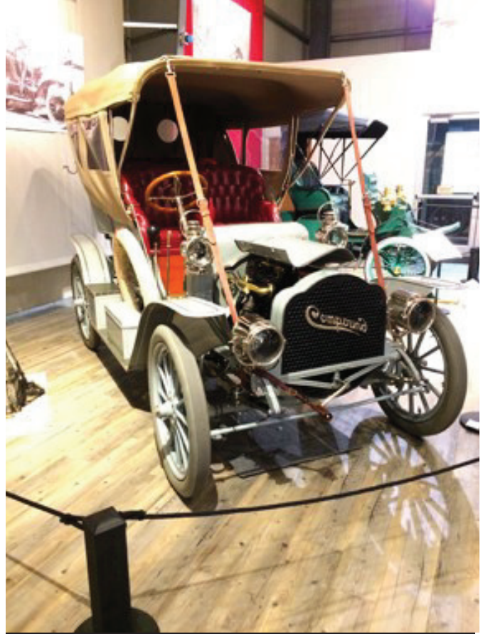
1906 Compound, built in Middletown, CT. It has a 294 Cu in engine, generating 16 HP. It was innovative, having the first power braking system and an unusual "Dead Man" switch mounted to the right of the driver. (Right hand drive car.) If the driver lifts his right hand off the switch, even to wave, the throttle would automatically shut off the engine and the brakes would be applied.