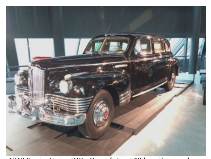
1949 Soviet Union ZIS. One of about 50 heavily armed security cars for Stalin. 160 HP, 80 MPH

There were many Russian vehicle manufacturers of both cars and motorcycles. On display was a very rare bullet-proof car used by Stalin. He actually had a large number of these cars as they were often used as decoys when he traveled. The car on display had a bullet-proof radiator, tires, and windows of special thick glass. This particular car was being repaired and was hidden in a factory while the others were being destroyed for scrap metal.