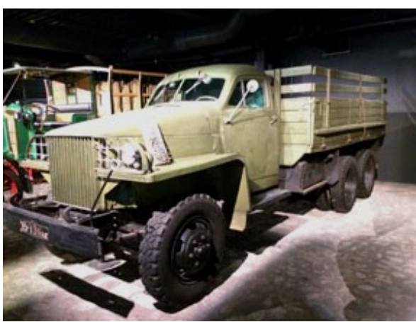
1944 United States Studebaker US6. 95 HP, 50 MPH

On display was a 1944 US6 Studebaker military truck that was sent to Russia as part of the WWII Lend Lease Program A quick review of the Lend Lease Program on Wikipedia states between 1941 and 1945, the US sold Russia over 400,000 trucks, along with combat vehicles, motorcycles, fuel, and foodstuffs. Originally the Lend Lease equipment was to be used until returned or destroyed. In practice, at the end of the war little equipment was returned. According to our museum docent, people did not want to return such important equipment as a Studebaker truck after such a devastating war, so people lied about the vehicles being stolen or in an accident. The people knew the vehicles were to be crushed and sent back to the US for scrap metal.