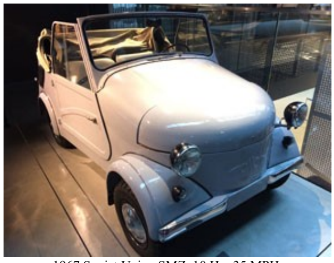
1967 Soviet Union SMZ. 10 Hp, 35 MPH

After WWII, there was a 10 year wait for a car so many people bought motorcycles from many manufacturers. Some of these vehicles were actually motorized bicycles. In addition, there was actually a very small two-person vehicle that looked similar to a golf cart made for handicapped veterans. (Smart cars of an earlier time.)