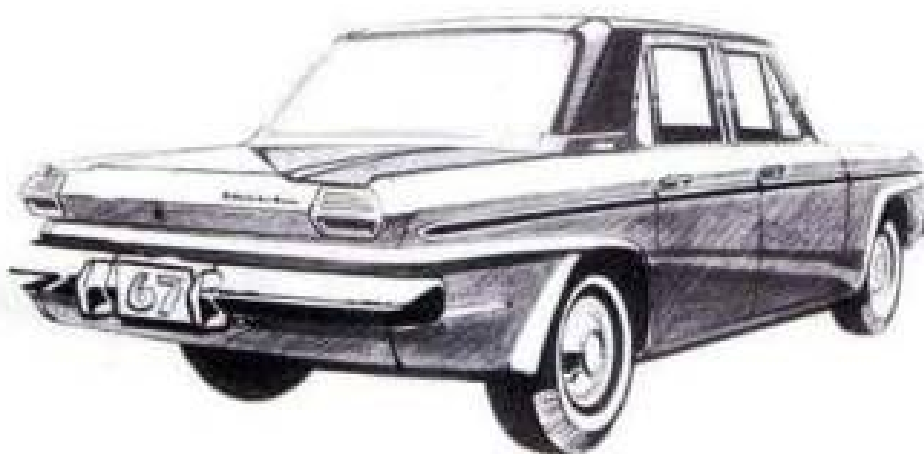
REAR-STYLE BODY SIDE MOLDING, LOWERED, w/VINYL INSERT.

REAR BUMPER RAISED SUBSTANTIALLY TO GIVE BACK-UP A LOWER LOOK. NEW LOWER SIDE MOLDING. BUMPER ADDED FOR ACCESS TO GAS CAP.