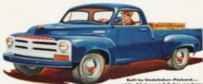
Built by Studebaker-Packard... world's 4th largest full-line producer of cars and trucks

New sensationally powered Studebaker truck engines...two great V-8s and an Econ-o-miser Six!