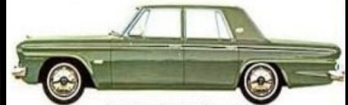
DAYTONA 4-DOOR SEDAN in Horizon Green