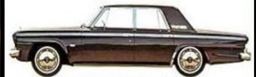
CRUISER 4-DOOR SEDAN in Midnight Black