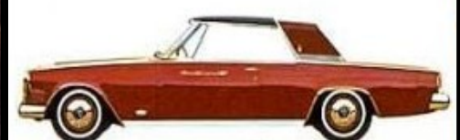
HAWK in Bordeaux Red