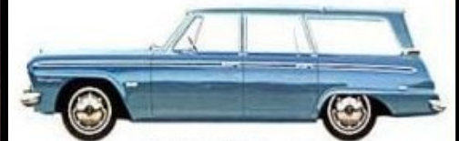
DAYTONA WAGONAIRE in Laguna Blue