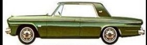
DAYTONA 2-DOOR HT in Jet Green