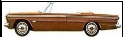
DAYTONA CONVERTIBLE in Bermuda Brown