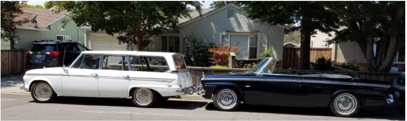
Andersons couldn't bring just one!!