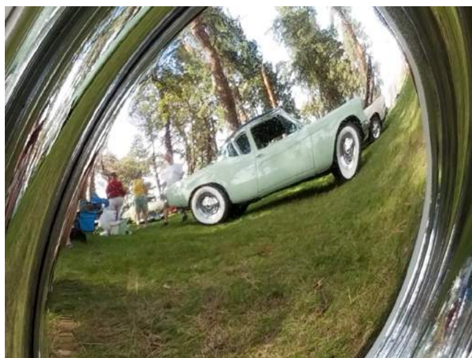
Reflectiing on a Studebaker