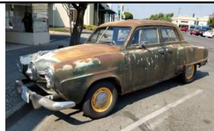
'50 Champion seen at a Marysville Barber shop, hope to recruit him. New interior, 12 volt conversion, original engine.

If you can host a meeting next year, let us know at the next meeting so we can get that part of the calendar wrapped up.