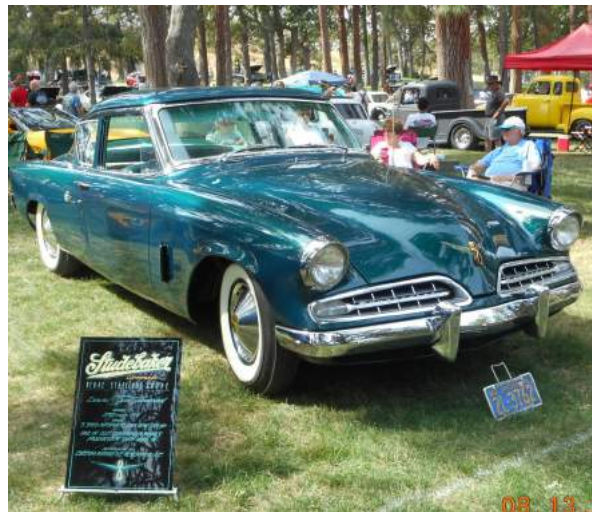
Owned it since 1956!!