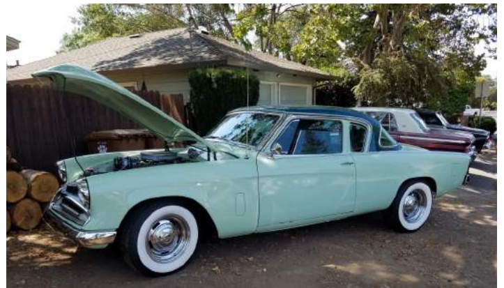
Steve's 55, complete with bugs from the road!